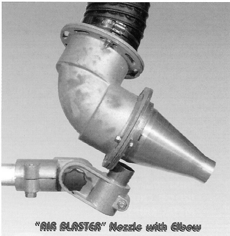
"AIR BLASTER" Nozzle with Elbow