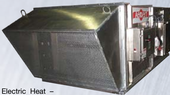
Electric Heat – Aluminum Construction

Aerovent has been manufacturing a wide variety of Air Handling Equipment since the 1950's. What started out primarily as Air Makeup Units for industrial facilities has now developed into an extremely versatile custom Air Handling Unit division. From our standard cataloged air makeup units to a fully custom air handler, our design engineers and variable manufacturing facility in Covington, Ohio can build just about any air handling equipment you may have in mind.