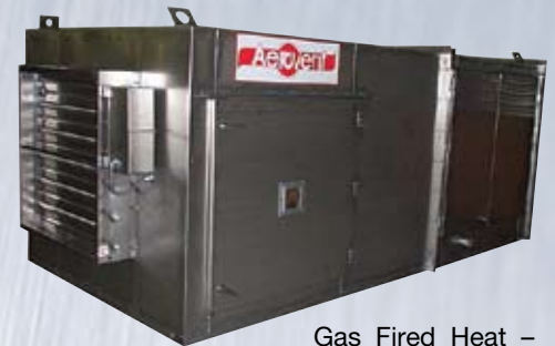
Gas Fired Heat – Stainless Steel